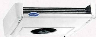
MZL 850 / MZS 850